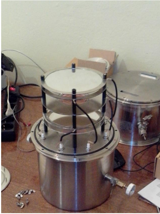
Fig 2. Photograph of twin back-to-back ionization chamber with ^{235}\text{U} target mounted on the common cathode.